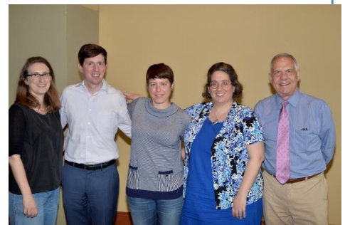
Above: American Studies Department Faculty, 2016