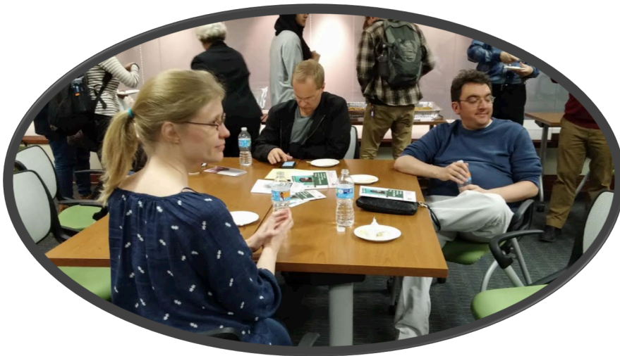
Bottom Right: The second Mentoring Matters session