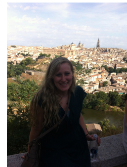
Updates from Study Abroad

The minor requires at least 16 credits of elective courses, 6 credits of Arabic language courses, and a capstone. Interested students should contact the Director of the minor, Dr. Cathleen Fleck, for more information at: cfleck@slu.edu .