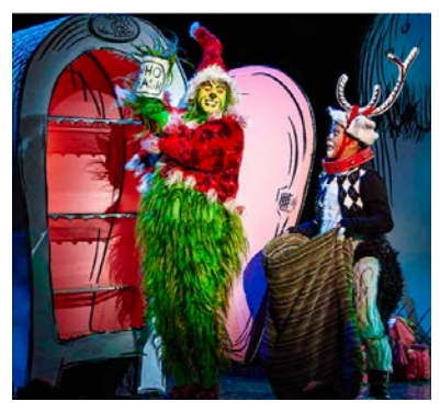
Fox Theater - How the Grinch Stole Christmas the Musical

<u>Date:</u> December 27th - 29th <u>Time:</u> 11:00 a.m., 2:00 p.m., 3:00 p.m., 7:30 p.m.