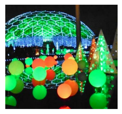
Missouri Botanical Gardens - Garden Glow

Walk through a winter wonderland with twinkling light displays and themed areas! Dates and prices vary.