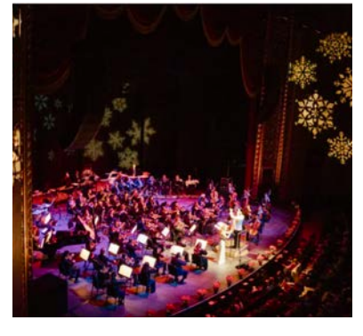
SLSO - Muppet Christmas Carol In Concert

Featuring more than two million dazzling lights, Garden Glow transforms the iconic setting of the Missouri Botanical Garden into a wonderland, rich with mesmerizing displays. LINK